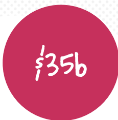
Gilead's U.S. sales for HCV in 3 years

This is a critical time: across all diseases, the price of branded drugs has tripled since 2008, and is poised to double again in the coming decade. For hepatitis C alone, 85% of patients who have been diagnosed are not getting access to treatment each year. For example, Louisiana estimates that it would cost $783 million to treat the 35,000 HCV patients in the state who are on Medicaid or uninsured; and Kentucky spent $70 million to treat just 833 patients last year.